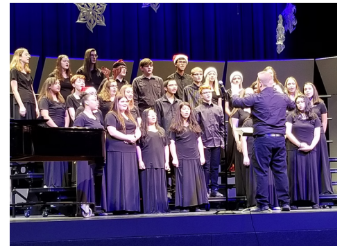
Holiday music performances by MS and HS band, choir, and orchestra.