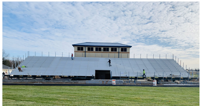
Progress being made on new football stadium.