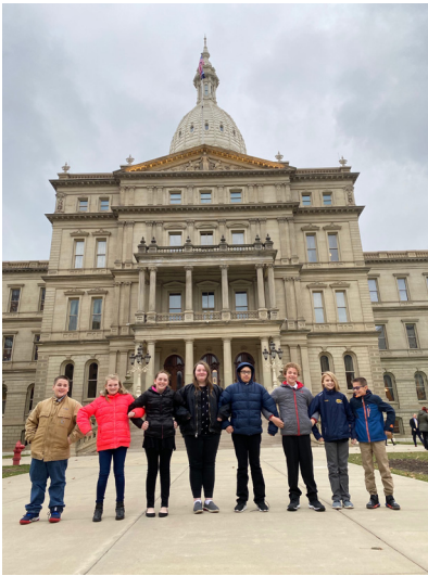
Middle School students attending MACUL Student Showcase.