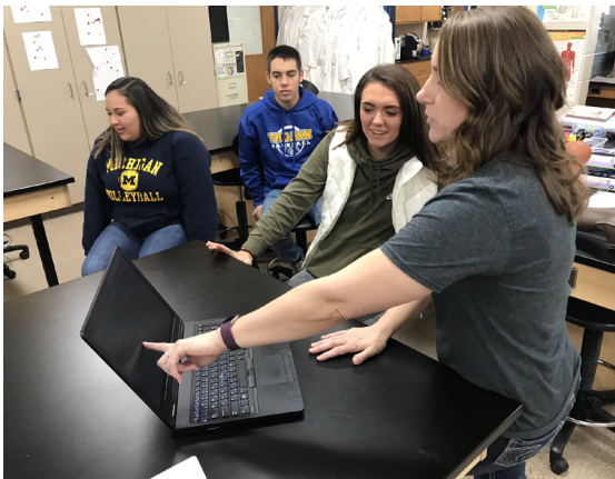
Madison Biomed students receive training from Washtenaw Public Health Nurse.