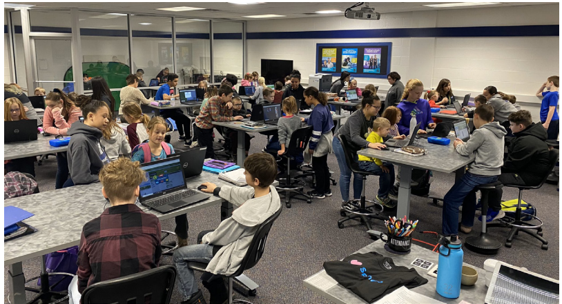
7th grade students host Hour of Code event for elementary students.