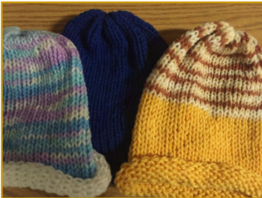
exhibit at the American Sewing Expo in Novi, Michigan in September. As the youngest exhibitor, she received many compliments for her designs and is named one of the designers to watch as she continues to develop her skill and sense of style. Learn more about Doll-ectable Divas online at: www.facebook.com/groups/939878062746654/ .