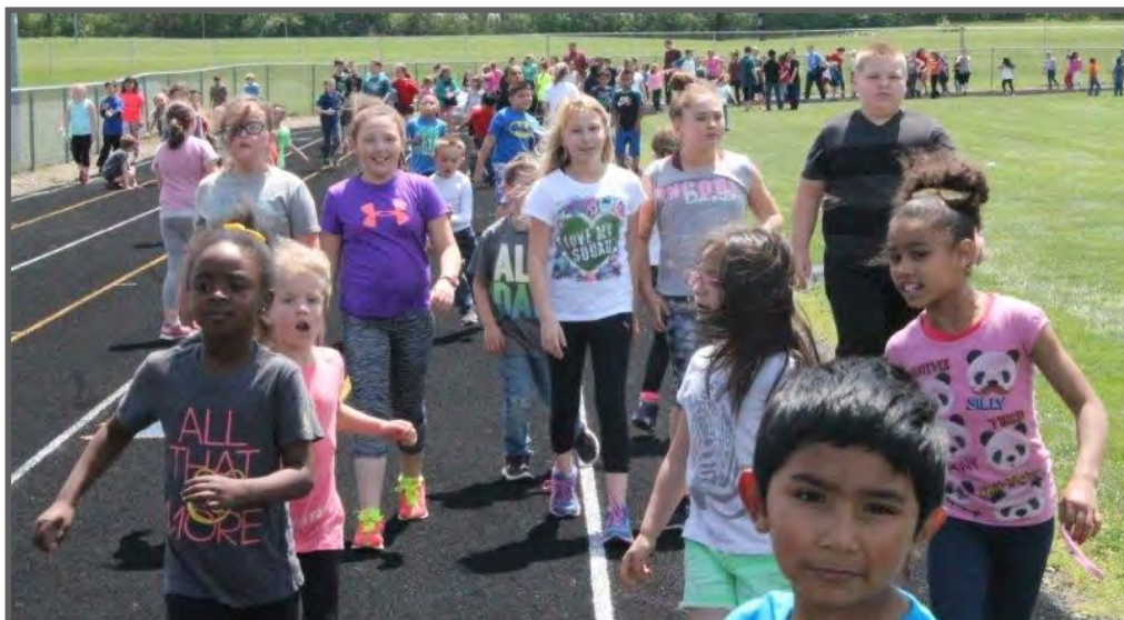
On May 13 Madison Elementary celebrated A.C.E.S Day (All Children Exercising Simultaneously) by walking and jogging as a team around the high school track.

Contact the middle school office at 517-263-0744 with questions about this policy.