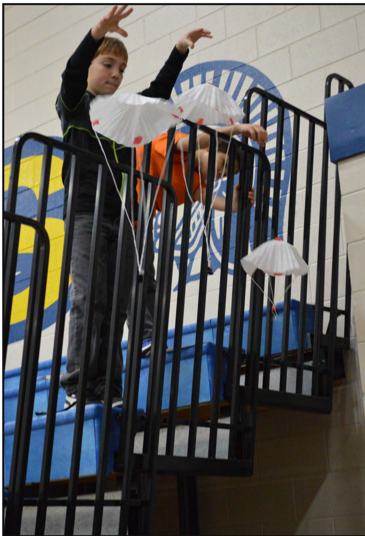
5th grade students made predictions, conducted experiments, collected data, and analyzed the results of their parachute drop project. Many were surprised by the outcomes!