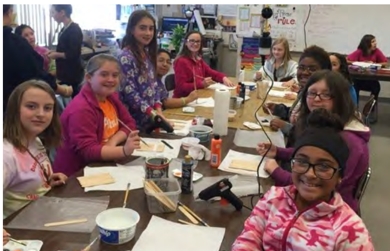
Middle school students enjoyed an afternoon of reward activities on Friday, December 4. Students who gave their first trimester exams their best effort earned the Fun Friday reward and were able to choose from a variety of activities, including computers, crafts, dodgeball, movies, and iPads.