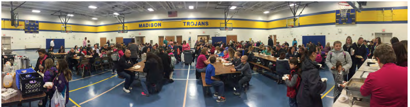
VIP Honor Roll Breakfast - December 10, 2015