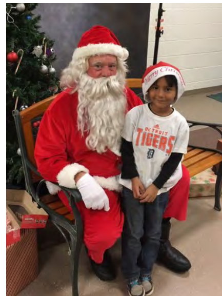
Santa has a long list of good students from Madison Elementary! The Jolly Old Elf visited our school for P.A.T.T.'s Donuts with Santa event. Thank you to the families who came out to enjoy breakfast, cookie decorating, and photos with Santa.